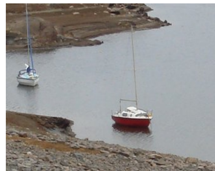
Its alright now..phew !

For 2023 we are putting together a sailing program for early in the New Year- if you have any thoughts on what you would like to see included let us know via email below – equally let us know if you can help support sailing in any way.