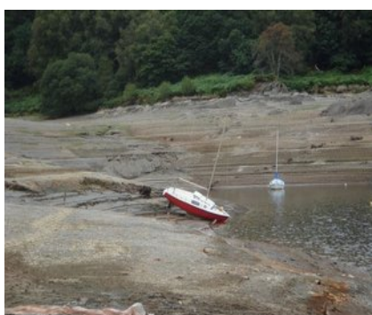
Who pulled the plug ???